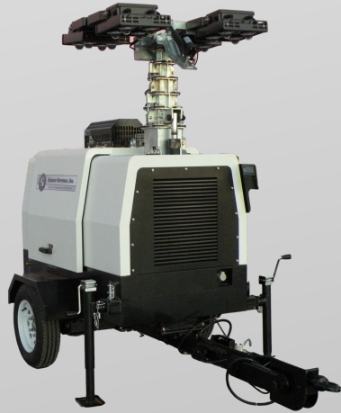
LTG212 Mobile Mini Light Tower