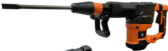
BNH-1145 w/ Flat Chisel