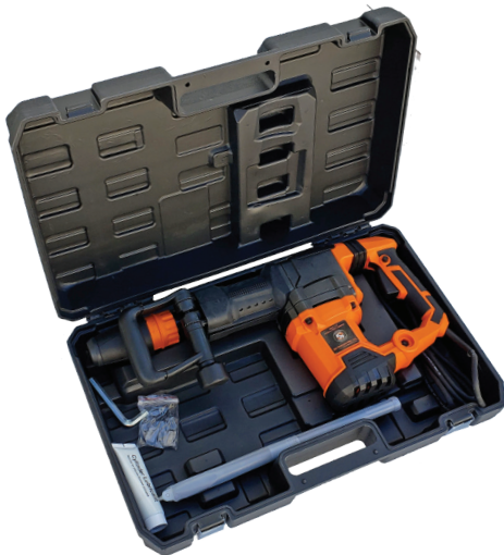
Durable Molded Carrying Case