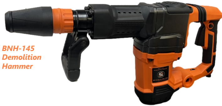
BNH-145 Demolition Hammer